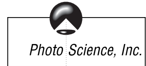
Photo Science is a full-service aerial photography, GPS field control, and photogrammetric services firm; with a staff of over 100 professional and technical personnel devoted exclusively to aerial photography, surveying, and photogrammetry. Our team of professionals includes 14 Certified Photogrammetrist, 3 Professional Engineers, 10 Professional Land Surveyors, 1 Certified Mapping Scientist, and over 70 cartographers, technicians, and support personnel.

Photo Science, Inc. of Kentucky 2670 Wilhite Drive Lexington, KY 40503 606-277-8700; 606-277-8901 (fax) info@photoscience.com (e-mail); www.photoscience.com