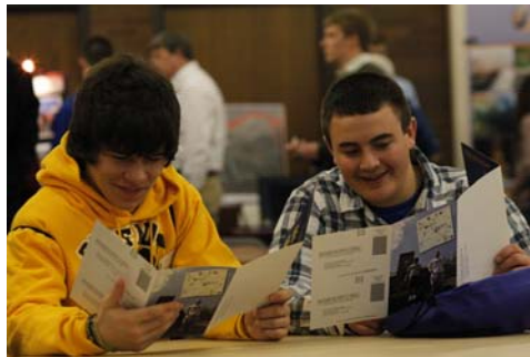
Above: Students looking over some of the material handed out during Engineering Career Day.