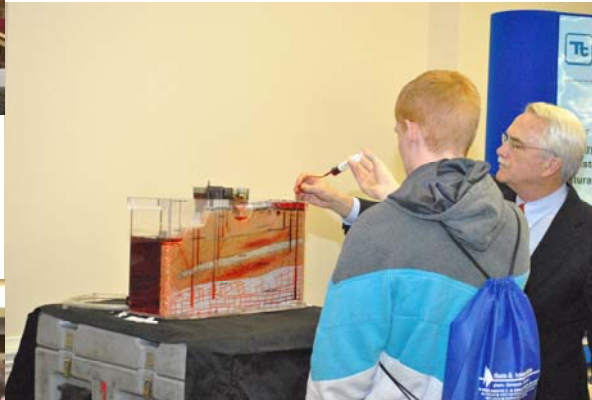
Left: The Center for Environmental, Geotechnical and Applied Science at Marshall University demonstrates the capabilities of 3-D modeling.